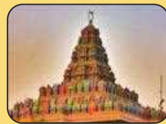
Shankar Viman Mandapam