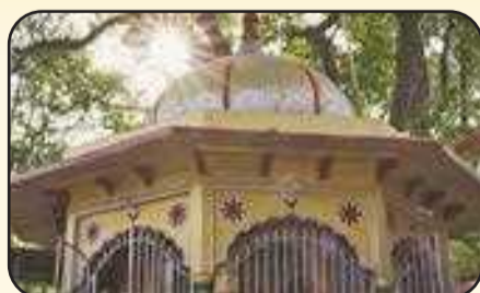
Mankameshwar Temple Corridor