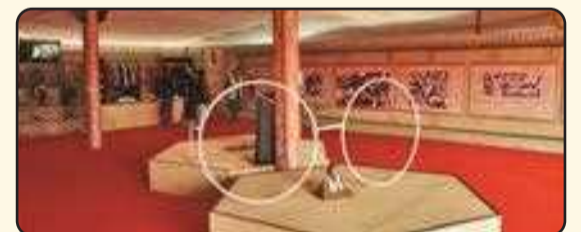
7. Kala Gram