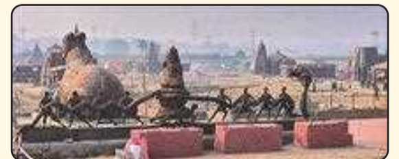
9. Shivalay Park