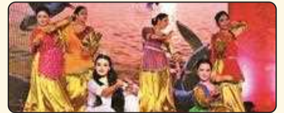
5. Cultural Performances