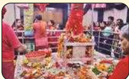
Alop Shankari Devi Temple