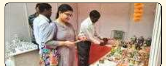
8. Exhibitions of ODOP, NMCG & Handicraft