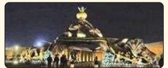
6. Sanskriti Gram