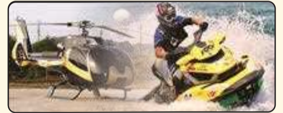
3. Helicopter Rides/Water Activity