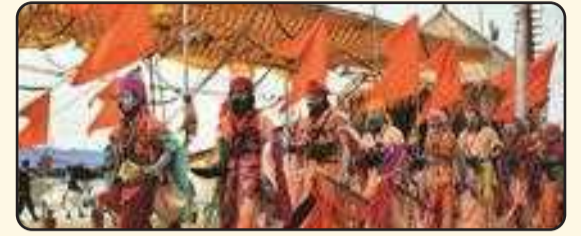
2. Mahakumbh Akhara Tour