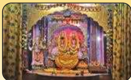
Dwadash Madhav Temple