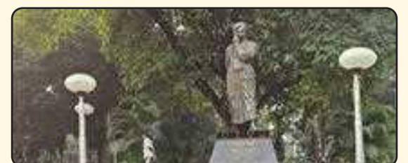
10. Heritage Walk