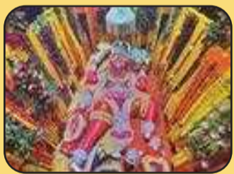
Shri Lete Hanuman ji Corridor