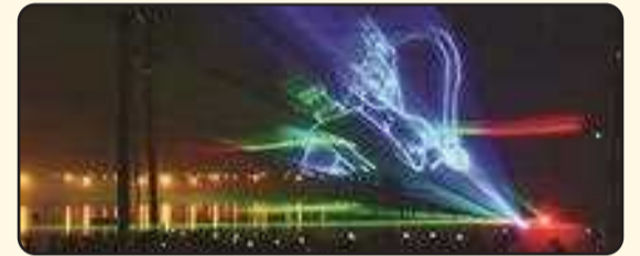
4. Water Laser Show