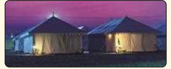
1. Tent City