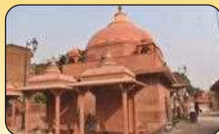
Bharadwaj Ashram Corridor